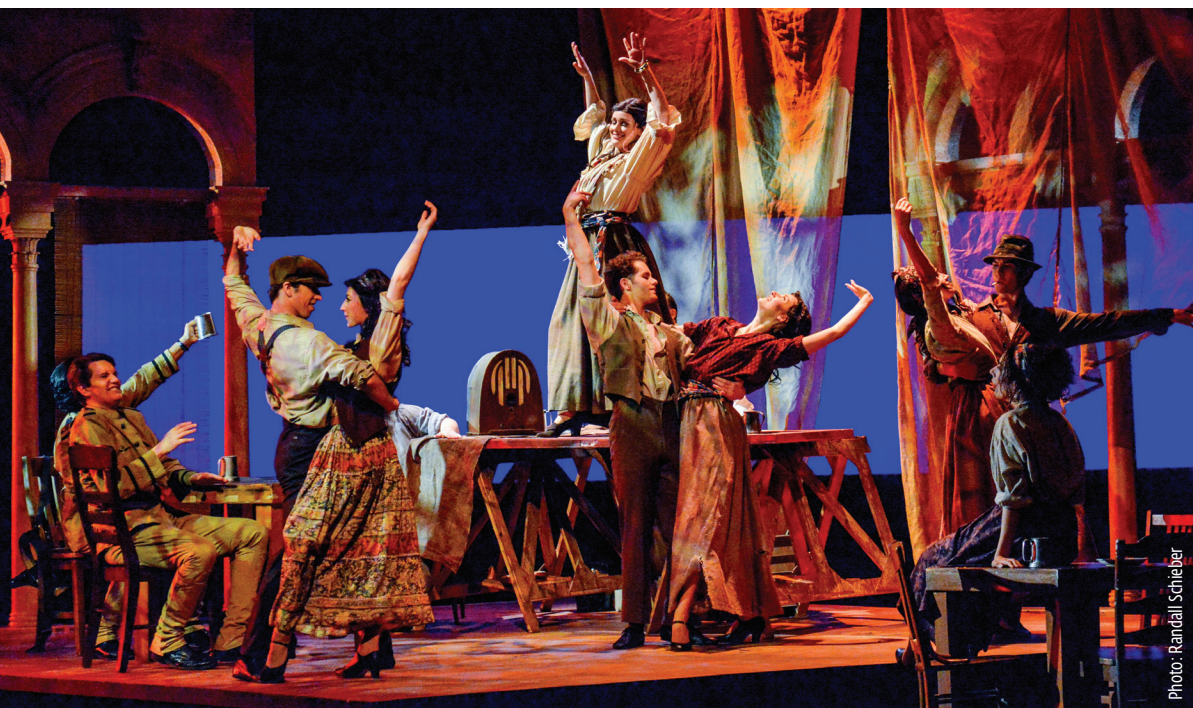
Carmen, May 2017

The mission of Opera Columbus is to enrich central Ohio by producing high quality opera, nurturing emerging talent, and cultivating exposure to opera in ways that feed the souls of our residents, bolster our cultural economy, and make central Ohio a great place to live, work and play.