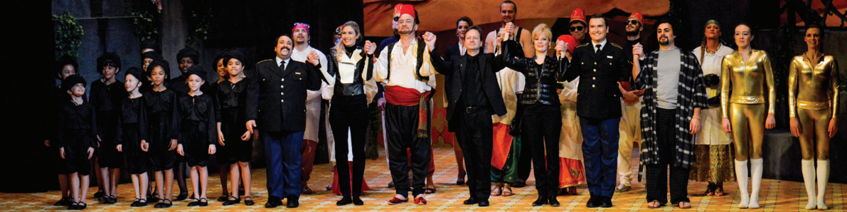
Mission: Sergallo, January 2017