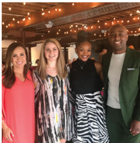
Boozy Brunch, May 2019

In 2018-2019, our “Opera Goes to School” education programs offered 30 performances at 19 schools and libraries, reaching 7,155 central Ohio K-12 students. Programs included children’s opera The Ugly Duckling ; Concerts in the Classroom; and the popular Improv Opera, which uses a fast-paced, interactive format to introduce students to operatic voices, terminology, and story structure.