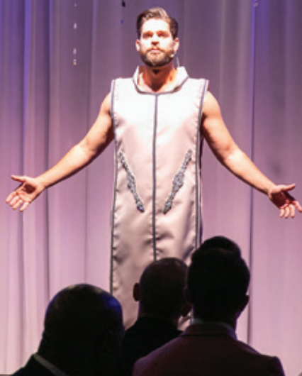
Opera Gala, March 2019