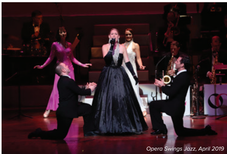
Opera Swings Jazz, April 2019