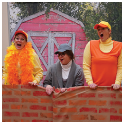
Educational Programming, February–April 2019