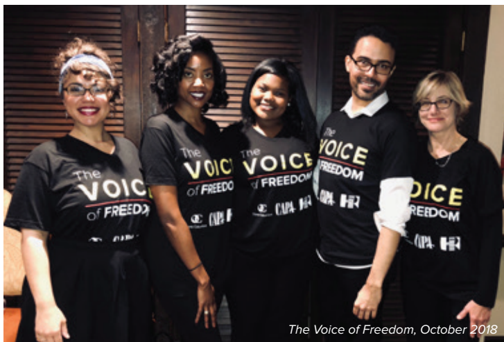
The Voice of Freedom, October 2018