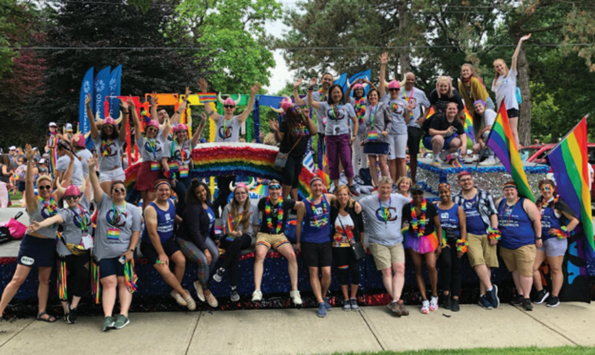
Columbus Pride Festival, June 2019