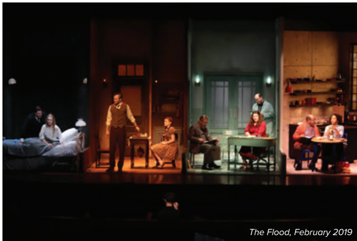
The Flood, February 2019